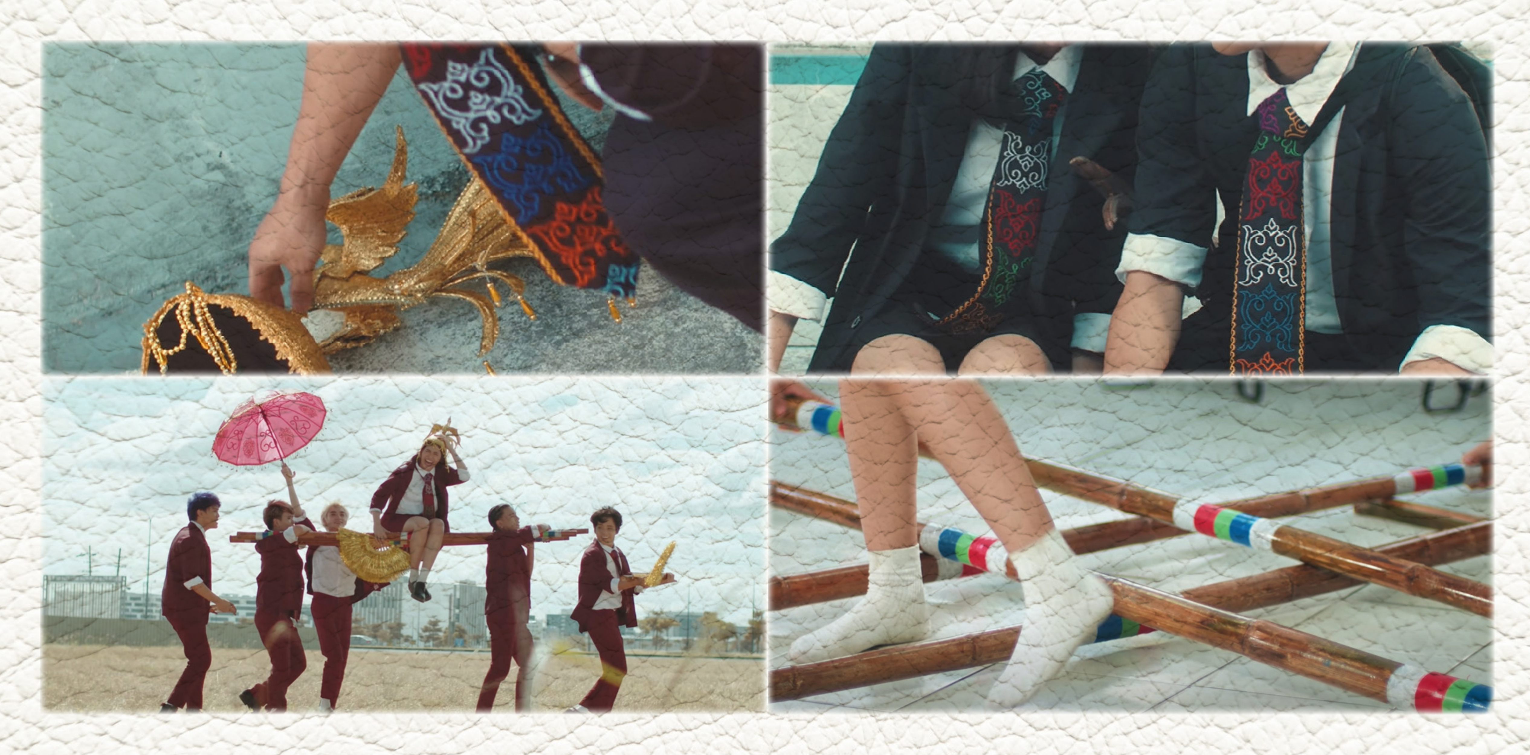
I was captivated by the rich Filipino elements hidden in every frame.