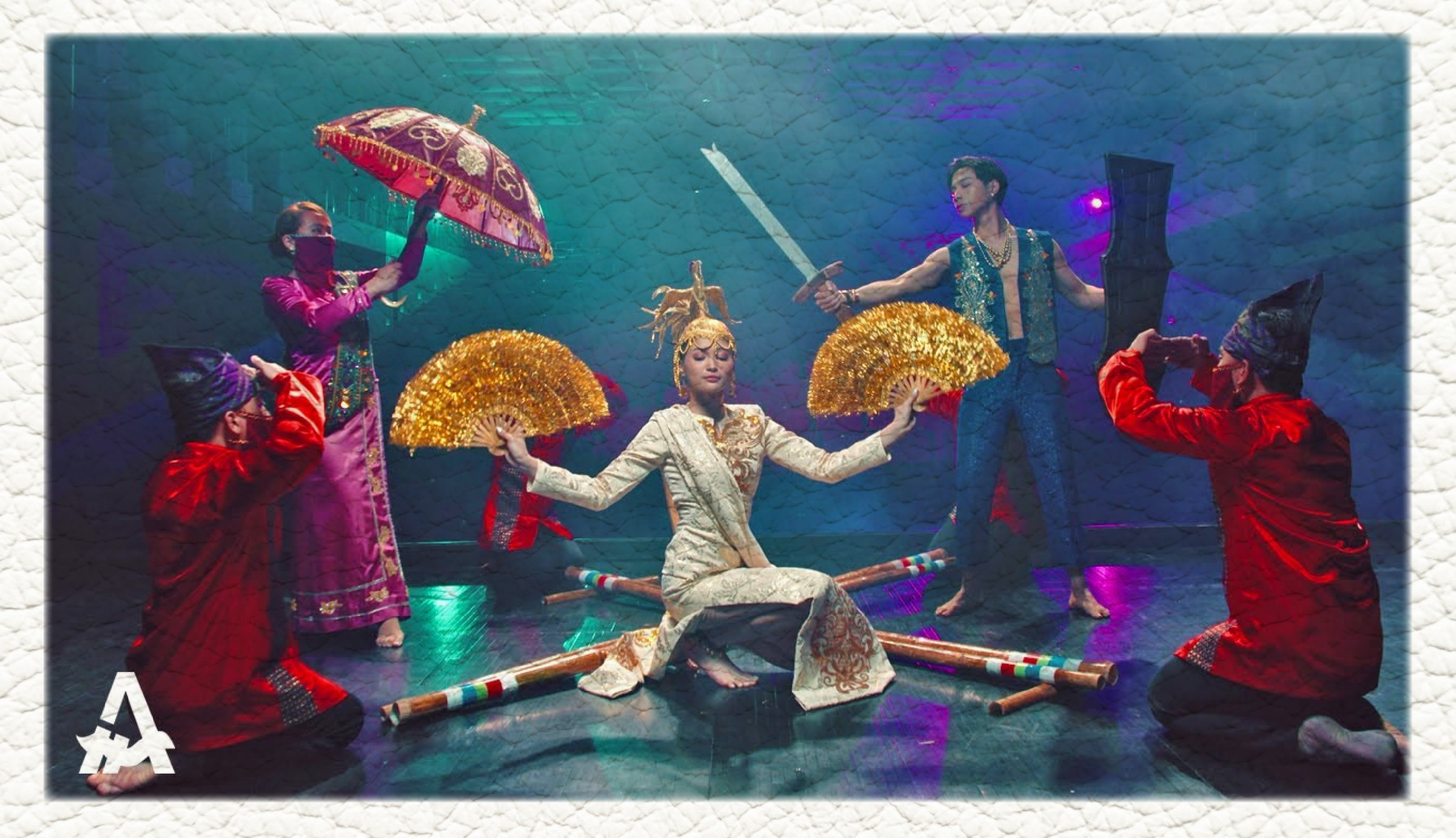
Produced and written by modern OPM prodigy Thyro Alfaro , 'Maharani' fuses neo soul with traditional southern Philippine and maritime South East Asian music, making use of instruments like kanun, gamelan, gangsa and byeon amidst an R&B and trap vibe.