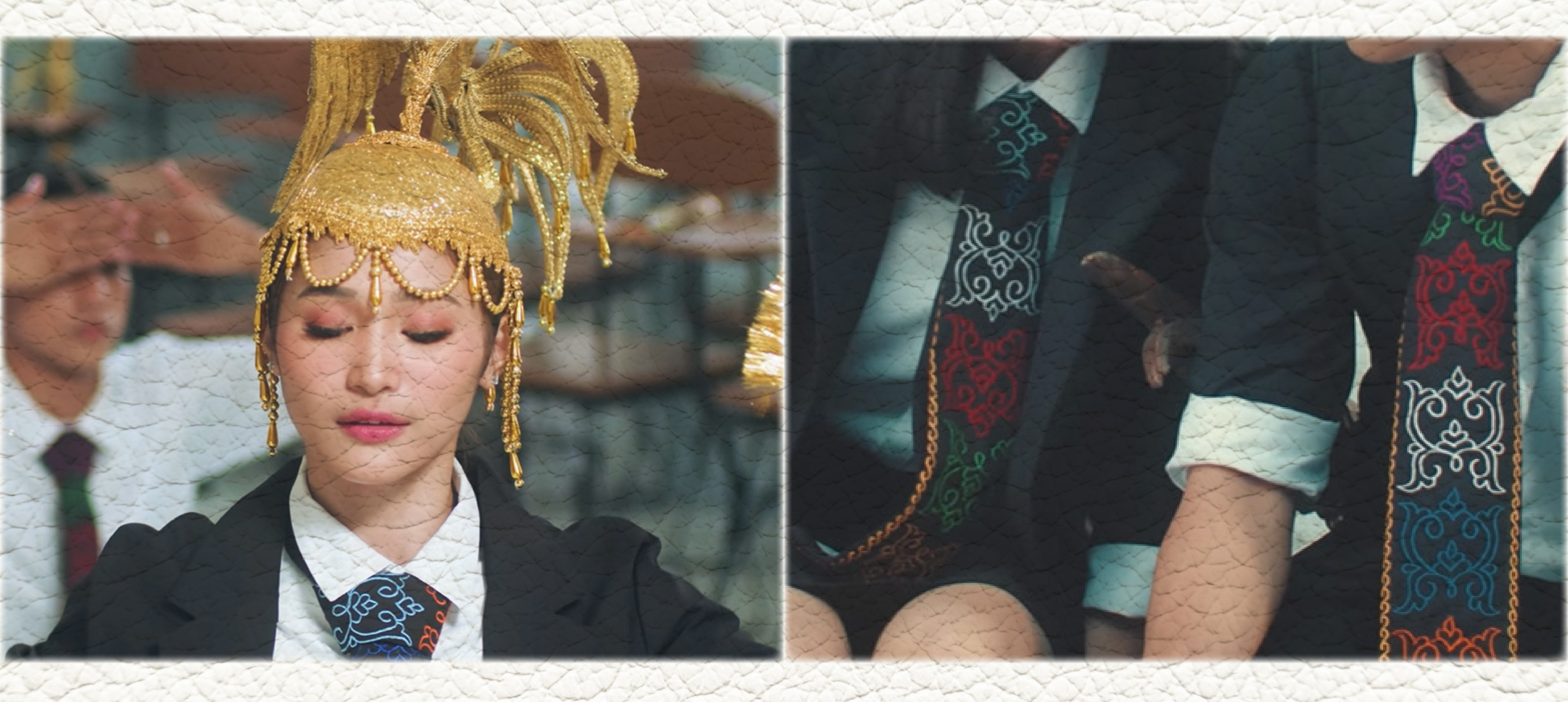
Each detail in the song connected me back to my roots—Filipino patterns, local craftsmanship, and the regal energy of a Maharani .