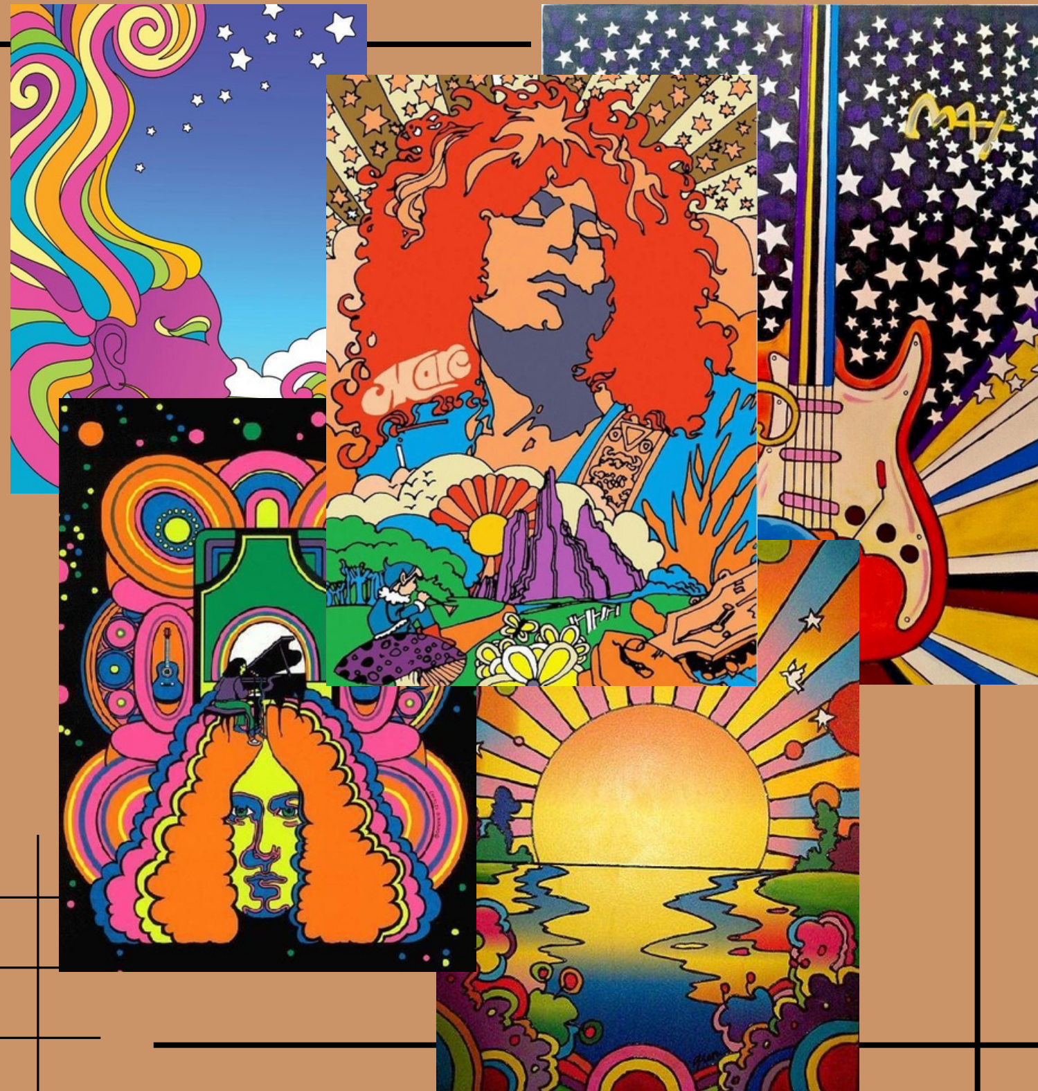
Peter Max's pop art