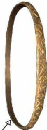
Grandma's gold bracelet from Morocco.