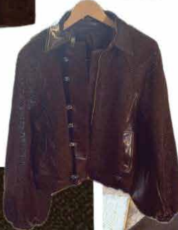
Knitting with leather threads in a circular crochet hook.