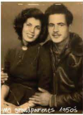
My grandparents 1950s