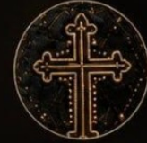
HAND AARI EMBROIDERY