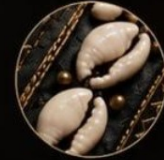
COWRIE SHELL ACCENTS