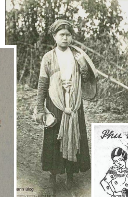
TENSION & RELEASE