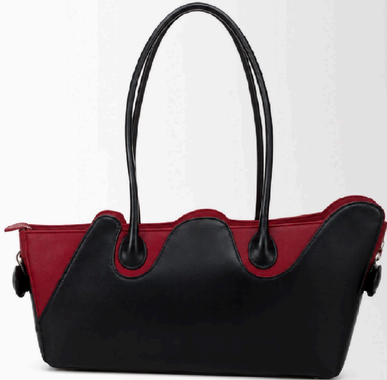
To final Product