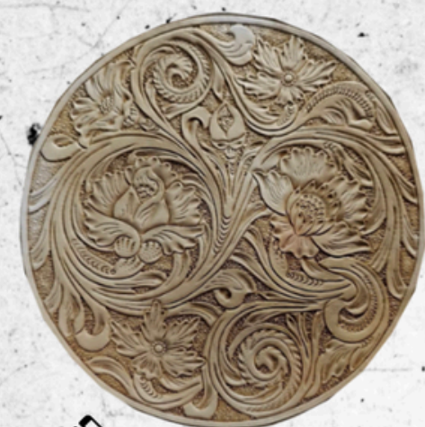
leather crawling 3D